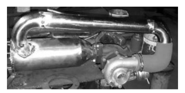
Figure 3: Mounting of combustor on The Turbocharger

The image below shows the mounting of the entire combustor on the turbocharger. The image clearly illustrates the simplicity of the mounting procedure. The SS304 pipe goes inside the compressor outlet; on the other hand, combustor's flange is matched with the turbine flange, both the flanges are bolted together by means of SS 10mm bolts.