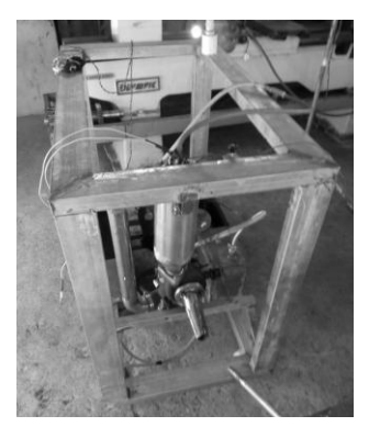
Figure 4:Completed Turbojet Engine Test Rig

The completed engine assembly is depicted below